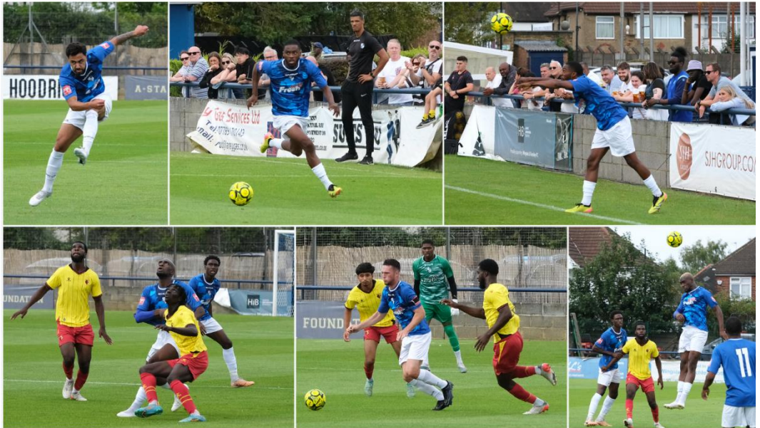
Watford U23 (H) – Saturday 3 rd August 2024